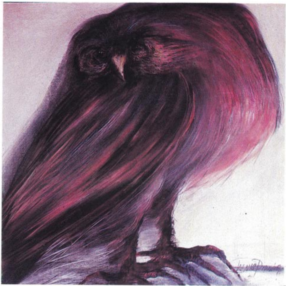
BIRD-Charcoal & Acrylic