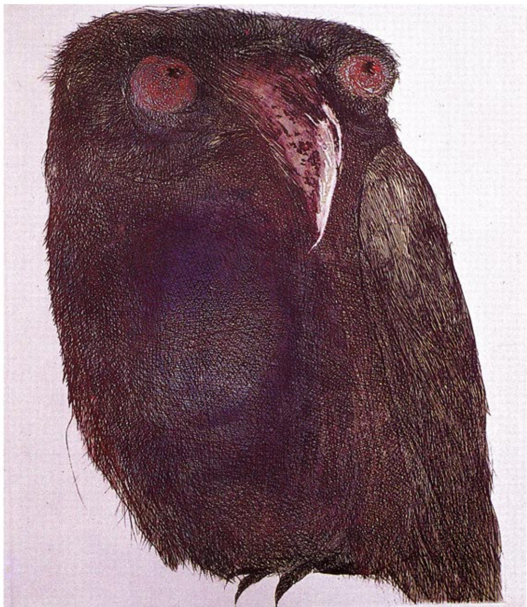
AVES - Intaglio (graphics)