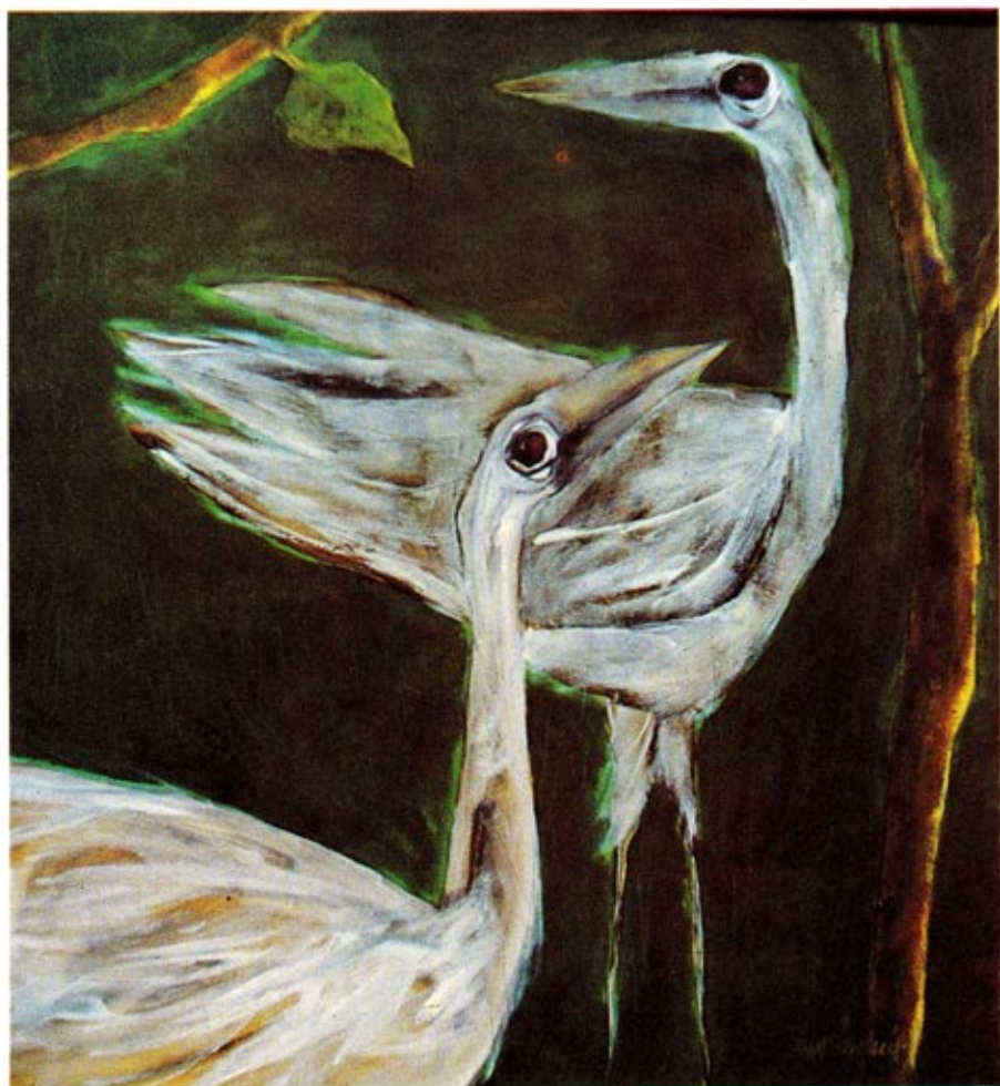
AMPHIBIOUS-Oil on canvas