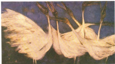
"AVES" (OIL ON CANVAS) 72"X45"