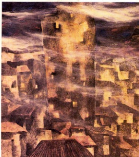
'ABODE' (OIL AND CHARCOAL) 35"X144"

ABC ACADEMY, DURGAKUND ROAD, VARANASI Printed at UTSAV PRAKASHAN LTD. NAGPUR