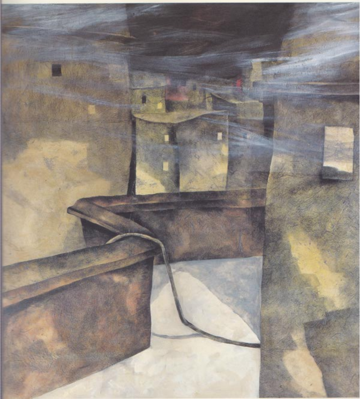
MIDDLETONE | 65" x 60" | Oil, Acrylic & Charcoal on Canvas | 1993